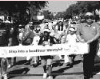
Steps program participants get active in the Festival of States parade in St. Pete.