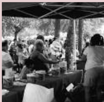
Festival-goers visit the Steps booth at the Festival of States parade.