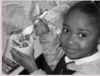
Pinellas County student enjoys healthier options in the school cafeteria.