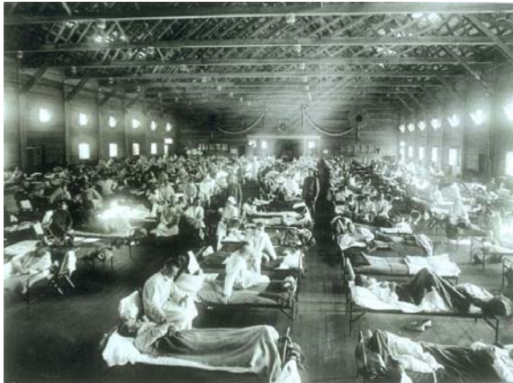
1918 influenza epidemic