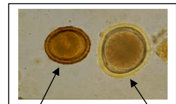
Baylisascaris 63-75 μ

Diagnosis: Regular parasite screens at a veterinary clinic using a simple fecal flotation test will identify the parasite. Young animals or animals that have received partial de-worming treatment might require serial parasite tests. The raccoon roundworm egg is slightly smaller than the dog roundworm egg ( Toxocara ). Your veterinarian should be able to distinguish the two using a special microscope measuring tool (micrometer).